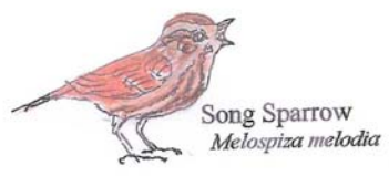
Song Sparrow Melospiza melodia