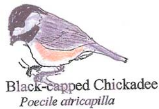
Black-capped Chickadee Parus atricapilla